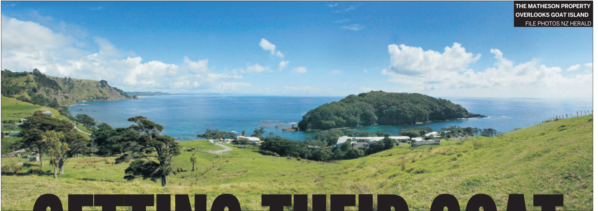
THE MATHESON PROPERTY OVERLOOKS GOAT ISLAND